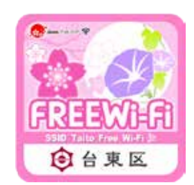
You can use it at locations with this sticker